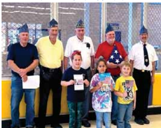
Voiture #1100 of Schuyler Co, Illinois went to Washington School and did flag presentation. Each child was given a coloring book and a flag to take home.