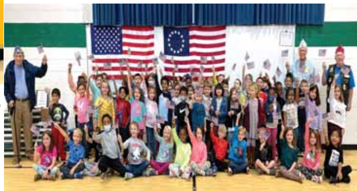
North Carolina Voiture Locale # 1237 has completed the Flags for First Graders Program for the elementary schools in Alamance County for this school year. The first school, B.E. Jordan Elementary was done on September 22 nd and the last, Eastlawn Elementary on December 7 th . We were pleased to be able to visit all 29 Elementary Schools in Alamance County this year, 20 public, 6 private and 3 charter schools. We distributed 2,420 Flags to students and teachers this year, drove 3,083 miles and expended 343 man hours. The presentations were done using 3 or 4 presenters per school with a total of only 10 volunteers. Without the devotion of these 10 volunteers we could not have been successful.