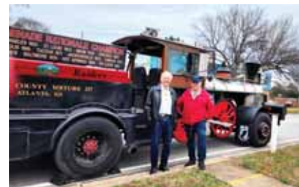
Saturday the 17th of December marked the first Post-Covid trip that the Voiture 217 train returned to what it does best: "Serving the Community". The Train and Crew was invited to American Legion Post # 258 in Jonesboro to attend their Annual Children's Christmas Party. Santa delivered toys to the Children followed by lunch with Santa and then all were invited to take a ride on the train. It was a Great Day of Fun!!