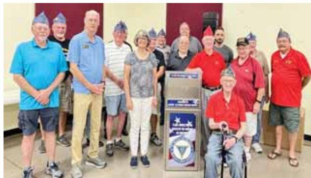
Voiture Locale #145, Grande du Indiana continues to participate in the 40 et 8's Americanism Program. Recognizing that the Flag Disposal Box at VFW Post 5864 was in need of replacement, Voiture #145 Voyageurs voted to replace the box with a new steel drop box similar to the USPS drop boxes. Mounted near the curbside outside the VFW Post it is now available for drive-thru dropping off of worn and tattered U.S. Flags.