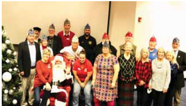
Grande du Oklahoma's Annual Christmas Party for residents at the JD McCarty Center for Children with Developmental Disabilities as held on 17 December 2022. Grande du OK founded the JD McCarty Center in 1946 as a Cerebral Palsy Hospital and is still active with the annual Christmas Party and Voyageurs on the Cerebral Palsy Commission. Due to Covid restrictions over the past 2 years, Grande du OK purchased presents for the residents, but the Voyageurs were unable to personally give the presents to the residents. This year the Voyageurs acted as Santa's elves and presented the presents to the residents. Voyageurs and Dames also donated presents to Santa's Workshop so toys could be given to out-patient children. It was great to be able to pass out the presents in person, and everyone had a great time.