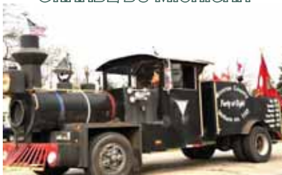
Voiture # 1153 of Monroe County participating in the Veterans Day Parade in Luna Pier, Michigan.